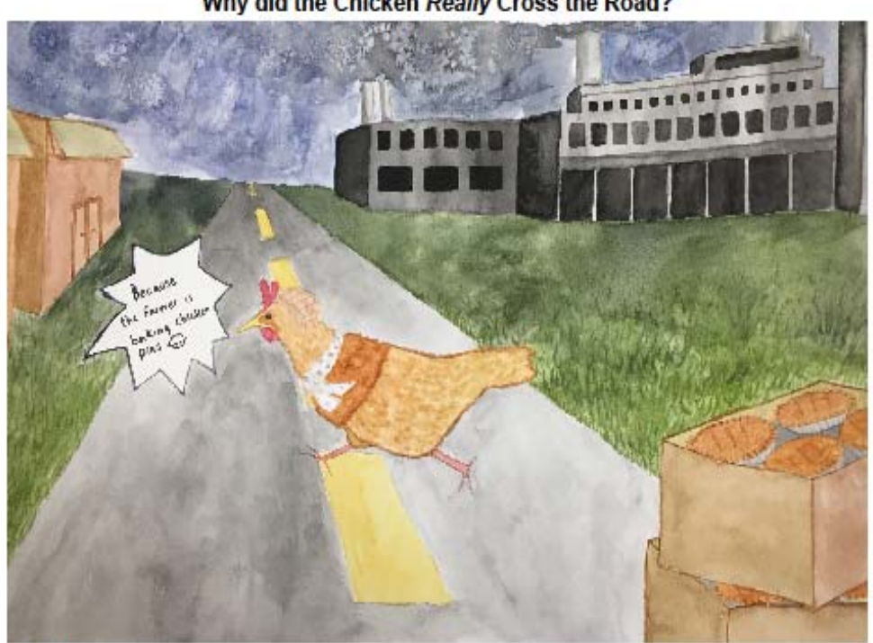
Why did the Chicken Really Cross the Road?

We had to stretch our creative muscle! We first made watercolour books so we could practice using watercolour and try out different textural effects like using salt or plastic wrap. Then we had to choose which creative challenge we were going to try: Combine two things to make something new or answer the question "Why did the chicken really cross the road?" We spent time illustrating our ideas in our sketchbook before choosing one to paint. Some students made "book works" because they had lots of ideas for one theme. It was one of our favourite assignments and during the critique it was really fun to see everyone's ideas and personalities come out! What creative ideas would you come up with?